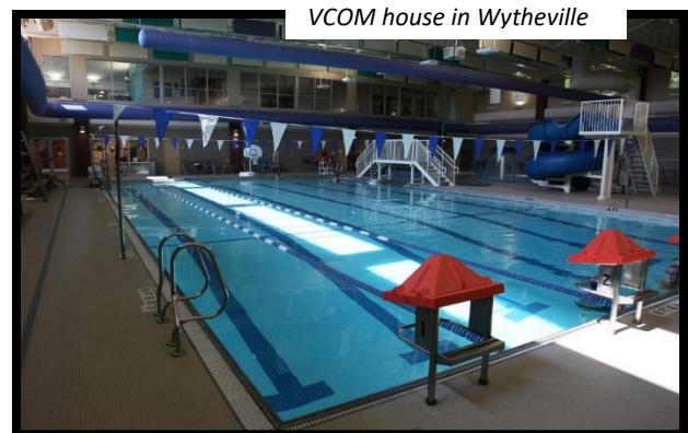
Pool at the Community Center