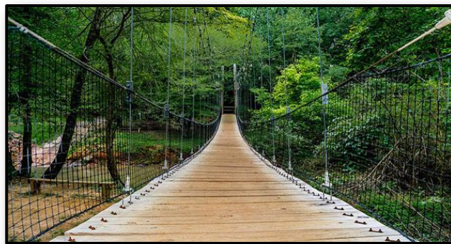
Ann Springs Close Greenway – 2,100 acre Nature Preserve with hiking, biking and horseback riding trails, a lake with kayak rentals and a pavilion for live music events. Located 15 minutes away in Fort Mill, SC