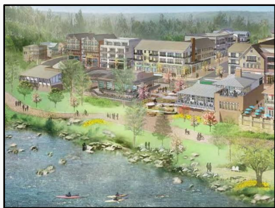
River Walk – A dynamic, riverfront community in Rock Hill with a distinctive, outdoor lifestyle.

Rock Hill is an outer suburb of Charlotte, NC located about 25 miles south of the Uptown area with a population of around 70,000 residents. Rock Hill has several great community parks as well as outstanding tennis and soccer facilities. The city recently completed a mixed use development called River Walk situated along the Catawba River that includes housing, restaurants, parks, a three mile paved greenway, kayak launch, mountain bike trails and much more. Rock Hill has a small but lively downtown area with local restaurants, an awesome coffee shop, breweries, and Food Truck Fridays at Fountain Park.