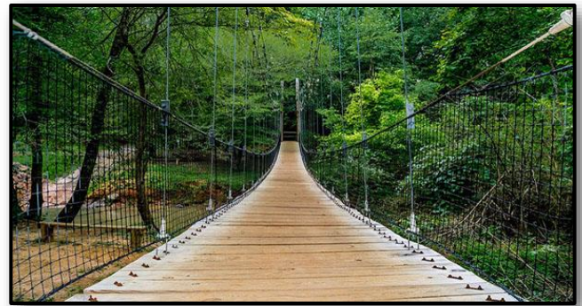
Ann Springs Close Greenway – 2,100 acre Nature Preserve with hiking, biking and horseback riding trails, a lake with kayak rentals and a pavilion for live music events. Located 15 minutes away in Fort Mill, SC