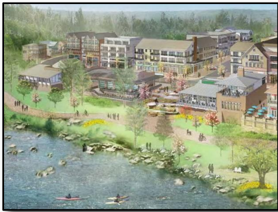
River Walk – A dynamic, riverfront community in Rock Hill with a distinctive, outdoor lifestyle.

Rock Hill is an outer suburb of Charlotte, NC located about 25 miles south of the Uptown area with a population of around 70,000 residents. Rock Hill has several great community parks as well as outstanding tennis and soccer facilities. The city recently completed a mixed use development called River Walk situated along the Catawba River that includes housing, restaurants, parks, a three mile paved greenway, kayak launch, mountain bike trails and much more. Rock Hill has a small but lively downtown area with local restaurants, an awesome coffee shop, breweries, and Food Truck Fridays at Fountain Park.